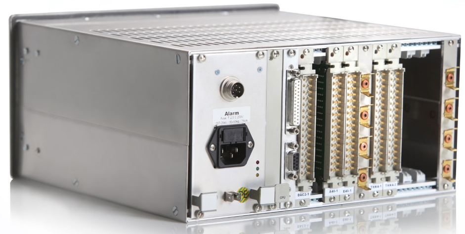
Program Controller SE-404 Device Connections