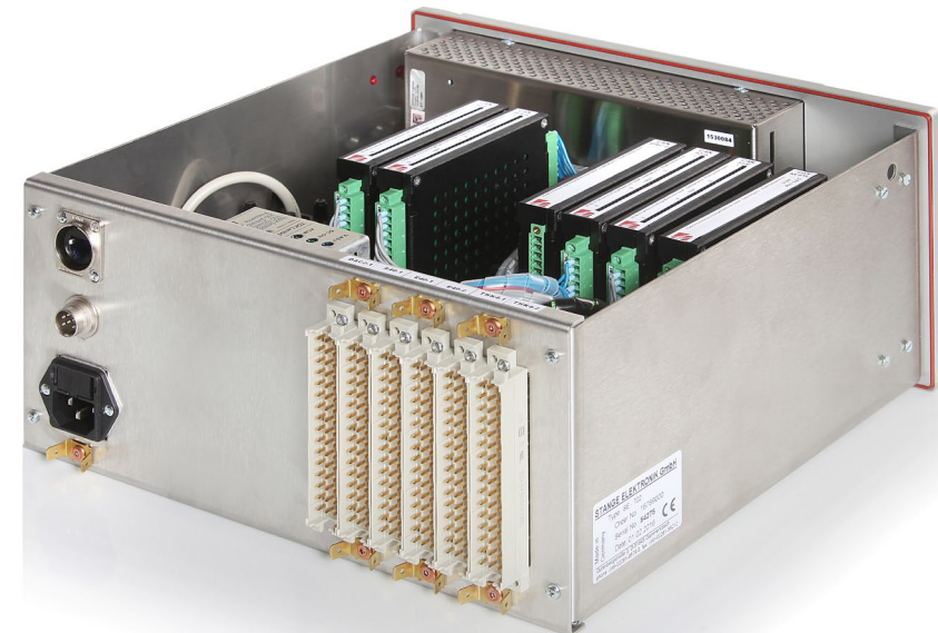
Replacement Box Connections