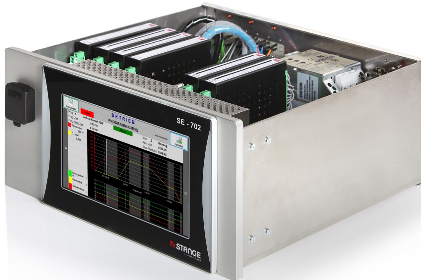
Replacement Box Front View